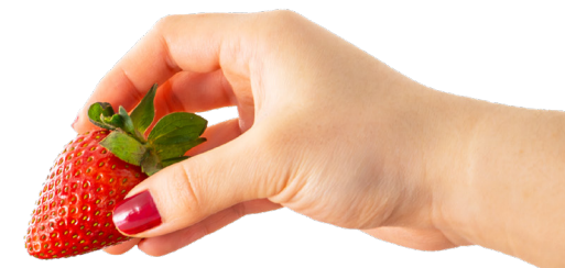
SEASONAL FRUIT BOARD