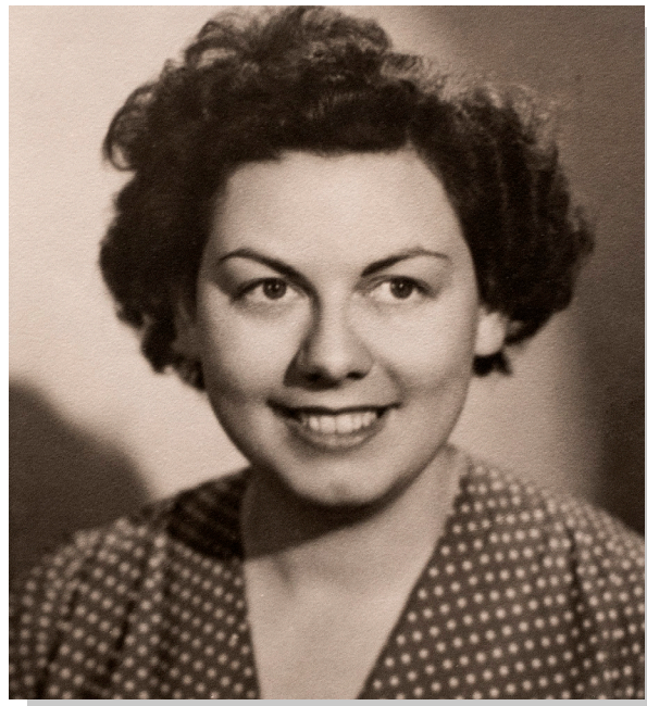
THE, MOLLIE STONE