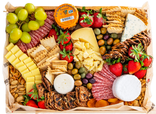
CALIFORNIA CHEESE BOARD

Discover the world of cheese with our vast assortment of fresh, aged, artisan, soft ripened, farmstead, washed rind, local, imported and more! Our Cheese Specialists have great recommendations for your cheese board. Pair with a mouth-watering array of honeys, jams, nuts and crackers. In addition to our vast selection of imported cheeses, we are also so fortunate to call so many extraordinary brands, local. Also consider us for your next gathering, and order a truly outstanding centerpiece that has been hand-crafted and designed by our Cheese Specialists.